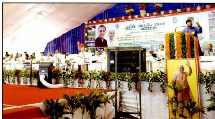
Shri Mnasukhbhai Mandavia, Minister for road and fertilizer (GoI) addressing the farmers during Krushi Mahotsav 2017 at Junagadh