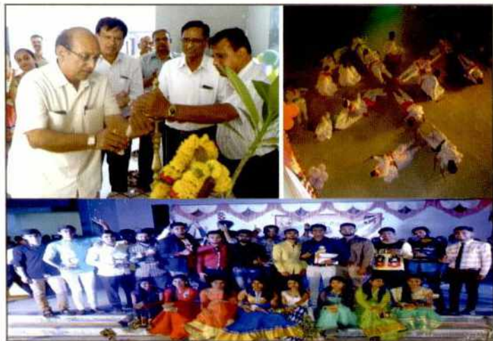
Celebration of Fresh fair 2017 at College of Agriculture, Amreli