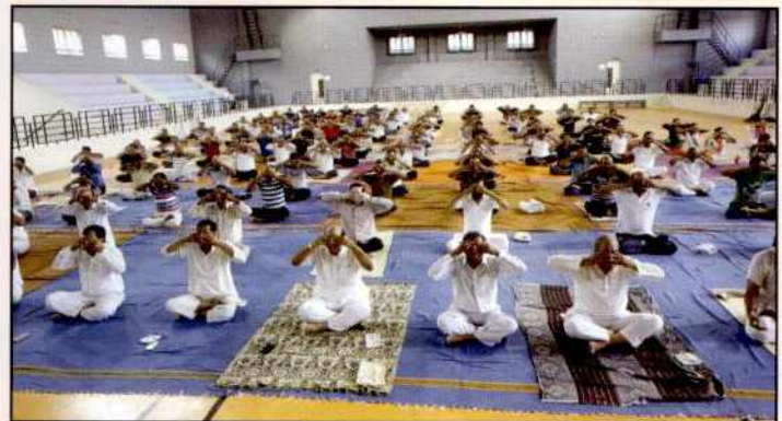
Celebration of "International Yoga Day" on June 21, 2017