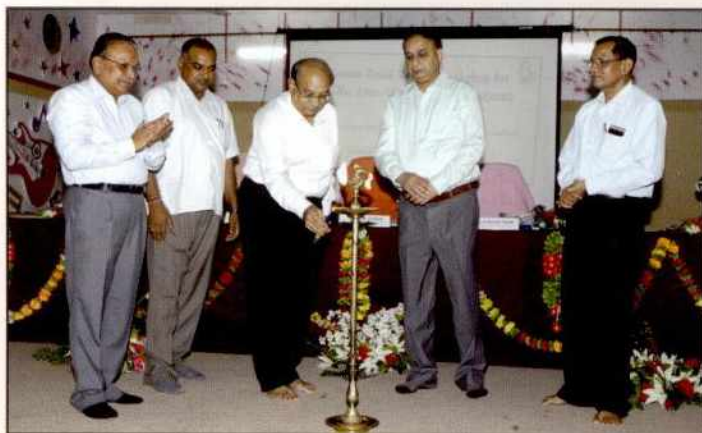
Inauguration of Annual Zonal Review Workshop for KVKs, Zone-VI (Rajasthan & Gujarat)