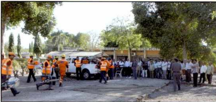
Mock drill by NDRF and fire brigade for rescue operation during earth quack organised at JAU, Junagadh on May 8, 2017