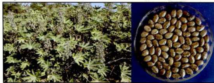
Gujarat Castor Hybrid-9 (GCH-9)

Gujarat Castor Hybrid-9 (GCH-9) gave seed yield of 3820 kg/ha, which was 9.0% higher than check GCH-7 (3503 kg/ha). It is resistant to Fusarium wilt and Macrophomina root rot and tolerant to sucking pests. It is a medium duration hybrid having apr of use branching habit and shallow cup shape leaves with medium plant stature and 48.3% seed oil content. This hybrid is recommended for release under irrigated condition in Gujarat.