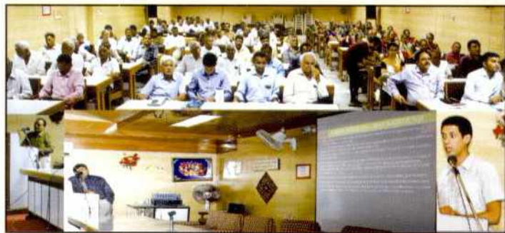
Scientists of FAMU, USA imparted training to scientists and farmers of Gujarat State