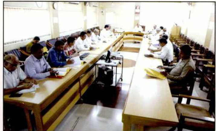
The Extension Council Meeting, JAU, Junagadh on June 27, 2017