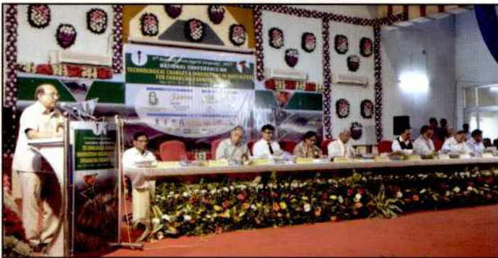
Inaugural session of National Conference on "Technological Changes & Innovations in Agriculture for Enhancing Farmers' Income"