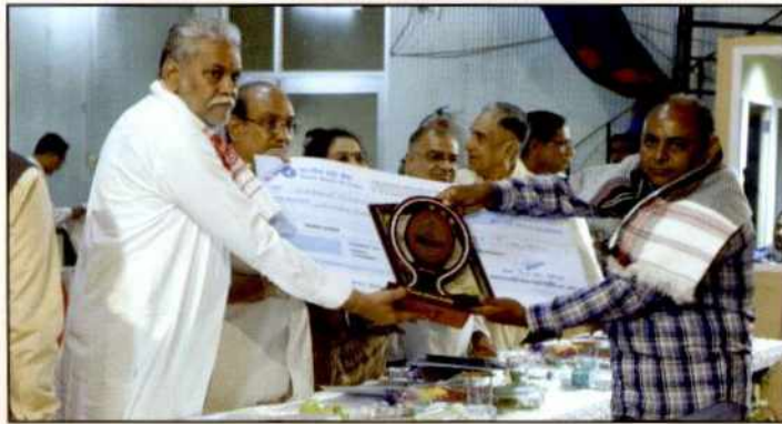
Shri Parshottam Rupala, Hon'ble Minister of Agriculture Government of India, New Delhi awarding Sardar Smruti Kendra Rajat Jayanti Awards