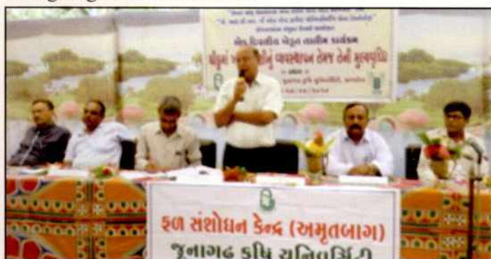
The training program on Saline Water Management in Sapota and its Value Addition