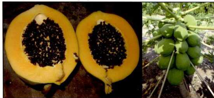
Gujarat Junagadh Papaya 1

The variety recorded mean fruit yield of 33.81 kg/plant (84.52 t/ha). It is early in flowering and fruit maturity, possessed a higher number of fruits per plant. Fruits are medium in size, oblong (Pyriform) in shape and light green color at maturity stage, but yellow colour during ripening stage. The pulp is sweeter and soft palatable with attractive orange yellow colour.