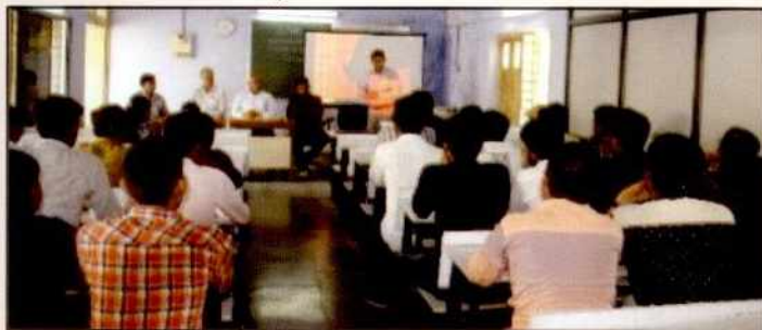
Guest lecture cum interactive session