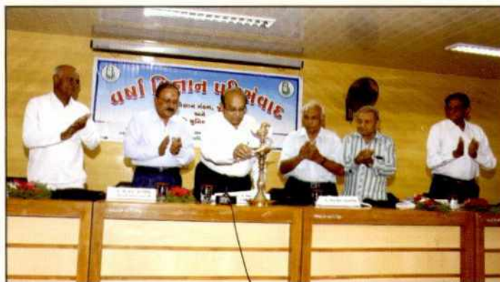
Inauguration of “Varsha Vigyan Parisamvad”