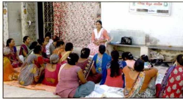
Faculty of KVK, Pipaliya providing training to the Farm women