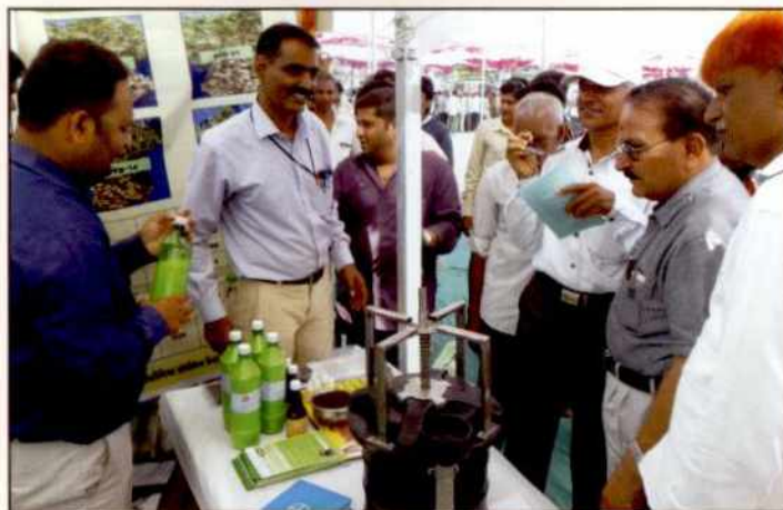
Exhibition stall of KVK, Nana Kandhasar during Krishi Mahotsav at Surendranagar (Vadhvan) on May 23, 2017

A total of 48 training programmes were organised by various KVKs (Amreli, Khapat, Jamnagar, Nana Kandhasar, Pipaliya and Targhadiya) during April-June, 2017, where in 1594 farmers and 332 farm women and 46 extension personnel participated. KVKs made 43 diagnostic visits, 195 field visits and organised 8 Khedut Goshties. A total of 2130 farmers visited KVKs, whereas KVK scientists visited 81 farmers' fields.