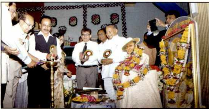
Inauguration of National Conference on "Technological Changes & Innovations in Agriculture for Enhancing Farmers' Income"