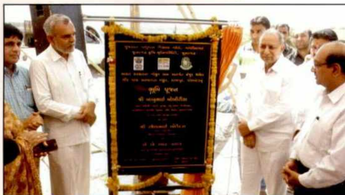
Bhoomi Poojan ceremony of Gir Cow Sanctuary