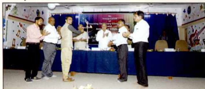
Annual day celebration by the students of CoVS&AH

Annual Day "Vet Impulse 2017" was celebrated with zeal and enthusiasm on April 14-15, 2017. Shri Babubhai Bokhiria, Hon'ble Minister, Water Supply, Animal Husbandry and Cow Breeding, Fisheries, Civil Aviation, Salt Industry, Government of Gujarat, Gandhinagar, inaugurated the 6 th Annual Day of the College on April 14, 2017. In his inaugural speech, Hon'ble Minister highlighted the importance of sports for youth and also interacted with the students. Hon'ble Vice Chancellor, Dr A. R. Pathak appreciated the efforts made by students and extended best wishes for the grand success of the function. The function was graced by distinguished guests; Dr V. P. Chovatia, DR; Dr A. M. Parakhia, DEE; Dr P.V. Patel, DSW; Dr P.H. Tank, Principal and Dean of the College along with other University officers. On this auspicious occasion, dignitaries released the Annual report and College Magazine of Veterinary College. Two days' celebration was ended with amazing cultural programme during the night presented by UG and PG students as well as faculty members.