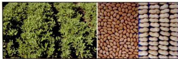
Gujarat Junagadh Groundnut 32 (GJG-32)

The Spanish bunch groundnut variety, Gujarat Junagadh Groundnut 32 (GJG 32) recorded mean pod yield of 3392 kg/ha, which was 22.6%, 22.6% and 15.4% higher than the check varieties; GG 7 (2766 kg/ha), GJG 9 (2765 kg/ha) and TG 37A (2816 kg/ha), respectively. It has higher oil content (53.9%), oil yield (1253 kg/ha) and protein content (27.5%) as compared to the check varieties; GG 7 (48.9%, 945 kg/ha and 24.5%), GJG 9 (49.3%, 978 kg/ha and 24.5%) and TG 37A (49.9%, 993 kg/ha and 26.4%), respectively. It is more resistant to tikka and rust diseases than the check varieties. This variety is recommended for release in Kharif season in Gujarat.