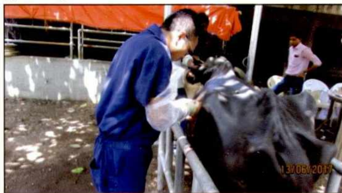
Rumenotomy at clinical camp Bhanvad

College of Veterinary Science & Animal Husbandry, JAU collaboratively organized three Veterinary Clinical Camps. First, at Chhatadiya Village, Tal: Dhariin collaboration with College of Agriculture, Amreli and Animal Husbandry Department, Amreli district on March 22, 2017. During the camp. Second, at Teaching Veterinary Clinical Complex (TVCC), JAU, Junagadh in collaboration with Animal Husbandry Department, Junagadh district on May 7, 2017 and third, at Bhanvad by Bhanvad Mahajan Panjarapol Gaushala, in collaboration with Animal Husbandry Department, Jamnagar district on June 13, 2017. Total 1131 animals were treated for different medical, surgical and gynecological ailments.