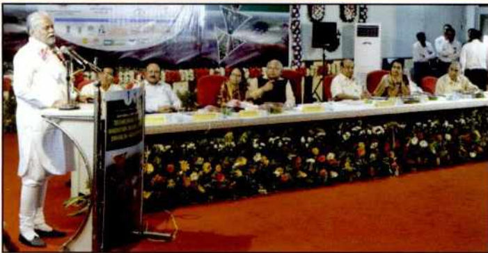
Valedictory Ceremony of National Conference on "Technological Changes & Innovations in Agriculture for Enhancing Farmers' Income"