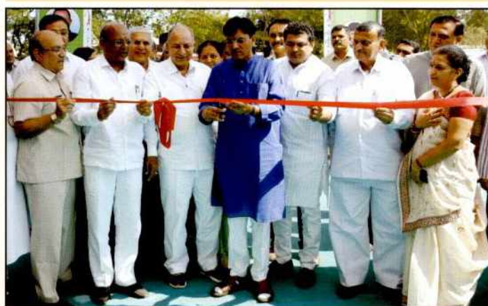
Shri Mansukhbhai Mandavia, Minister for road and fertilizer opening pradarshan of Krushi Mahotsav 2017 at Junagadh