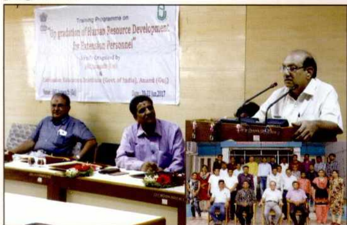
Training programme on "Up-gradation of Human Resource Development for Extension Personnel"