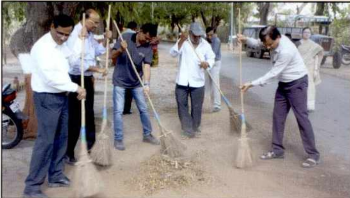
University Officers and Scientists in Swachhta Abhiyan on May 27, 2017