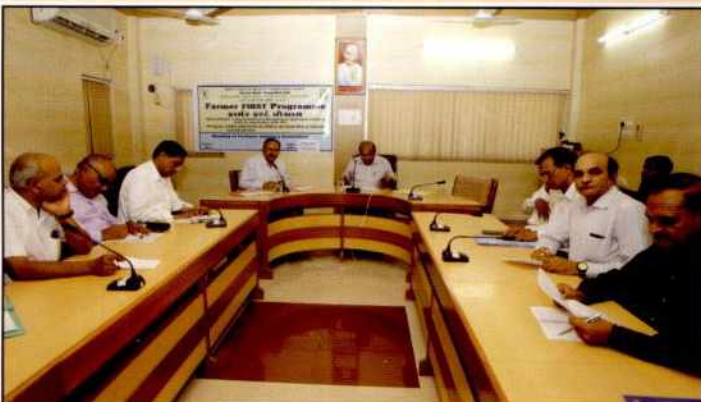
Meeting of Institute of Advisory Committee of the project "Integrated Resource Management in Agriculture and Allied Fields of Stakeholders Under Farmers First Programme" on April 17, 2017